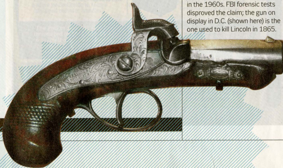
The derringer used to assassinate Abraham Lincoln was actually a deringer, with one r. Renowned pistol-maker Henry Deringer's original Philadelphia Deringer, produced from 1852 through 1868, spawned copycats worldwide, and the name—albeit misspelled—became a generic term for any small, large-caliber handgun.