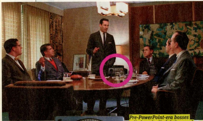
Pre-PowerPoint-era bosses relied on the Kodak Carousel (#71) for visual communication. Here, Don Draper pitches the ad campaign for the gadget on Mad Men .