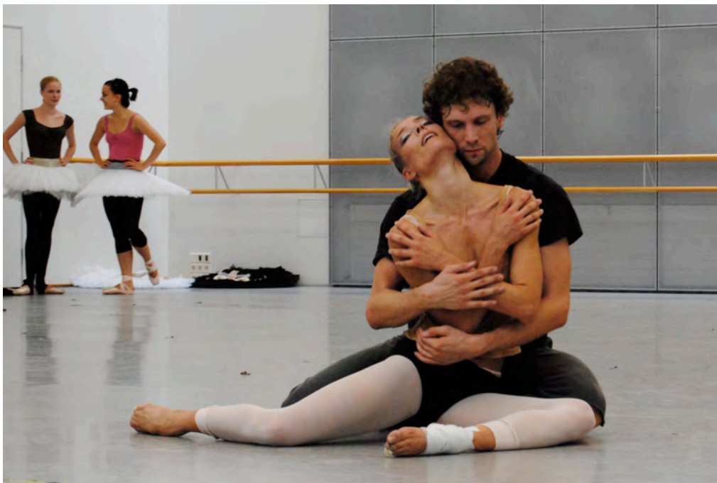
Picture 3. Relational form of passion in the air

In addition to the shared, mundane and playful moments of passion and vulnerability offstage, the dancers highlight the importance of the colleagues and other people for their passion for work, and as a freelancer dancer expresses, "I couldn't ever think about doing all this just by myself". The importance of the partner is rendered visible in the quote below, and the tension between on and offstage worlds in relation to passion and vulnerability is caught in the quote below as well. Even if the moments onstage are often described with the words "magical" and "breath-taking" by the dancers, they are not enough to keep their passion for the profession alive. As mentioned previously, it is the everyday training that the dancer must enjoy to keep his or her passion alive.