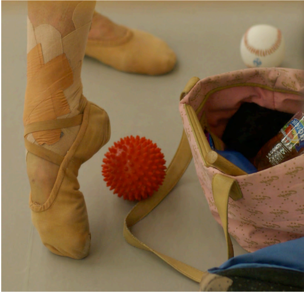
Picture 8. The body equipped with various tools

As one ballet dancer expresses, Picture 8 captures the “rugged atmosphere of the everyday offstage”. Moreover, the strongly taped ankle in Picture 8 illustrates the physical fragility and discomfort of a dancer’s profession. For example, choosing the right pair of pointe shoes is a “long and devoted procedure”, and aims at the perfect sensation of one’s embodied agency onstage. Nevertheless, being truly comfortable with one’s body is not achievable, as this quote by one ballet dancer reveals: