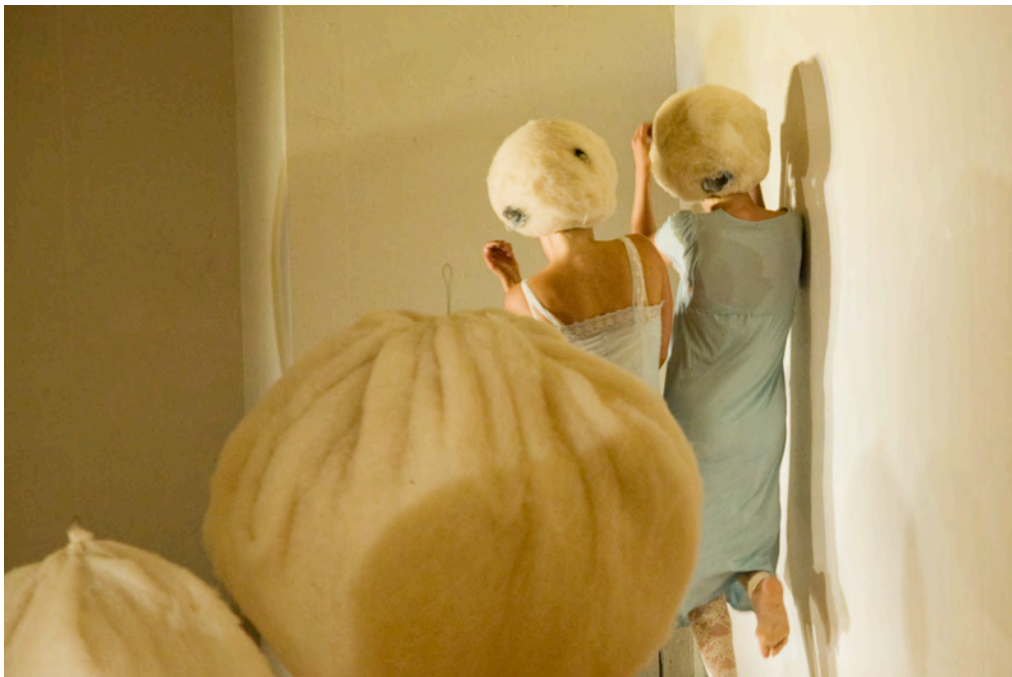
Picture 7. Performing passionately for children

In the contradiction of being constantly in front of others, the lack of appreciation and attention makes a dancer’s embodied agency vulnerable as well. One freelance dancer showed me Picture 7 in which two dancers are performing with amusing hats on.