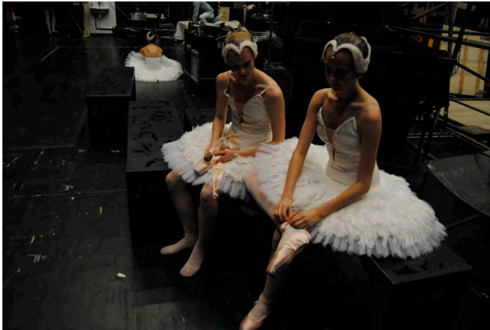
Picture 4. Vulnerable swan chicks offstage

step onstage... that's magic. (Retired ballet dancer, an extract from a photo-elicitation interview, 19.4.2013)