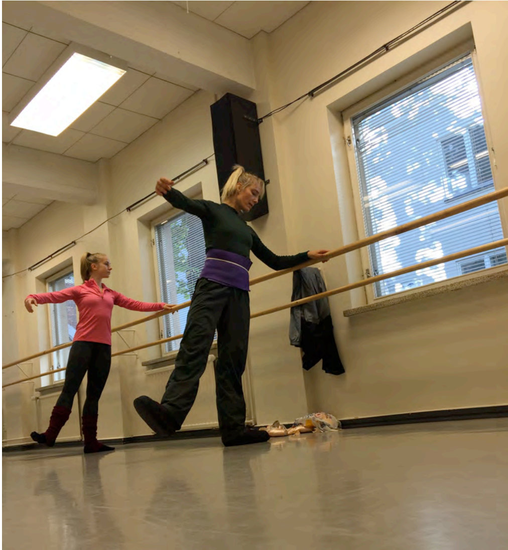
Picture 1. Keeping passion alive through mundane rehearsing

alive. (Retired ballet dancer, an extract from a photo-elicitation interview, 19 April 2013)