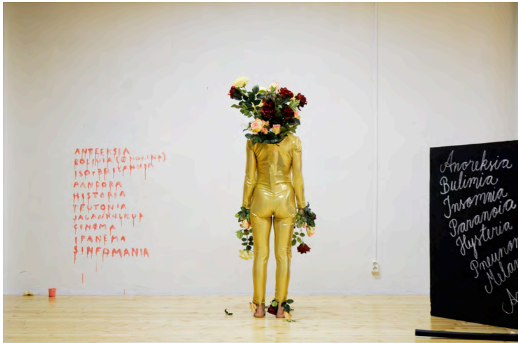
Picture 6. Wounding obsessions of a dancer

Here we can see Picture 6 rendering a bizarre atmosphere in which the dancer is wrapped in a glorious, golden costume with roses on her head, but at the same time she is surrounded by vulnerable words of obsessive desires of her embodied agency. The separate words written down on the wall with bloody paint are like loose descriptions of the dancer's fragile embodied agency. Interestingly, the appearance of the dancer is androgynous; her forward set pose is masculine, but the slightly curved pelvis and the close-fitting costume reveal that it must be a "she". Thus, Picture 6 gives an impression of passion and vulnerability existing among embodied agents similarly whether it was a "he" or a "she". In addition, the words of the dancer above reveal the complexity of the interplay between passion and vulnerability among embodied agents; the obsessive thoughts derive from her passionate attitude toward the dance profession.