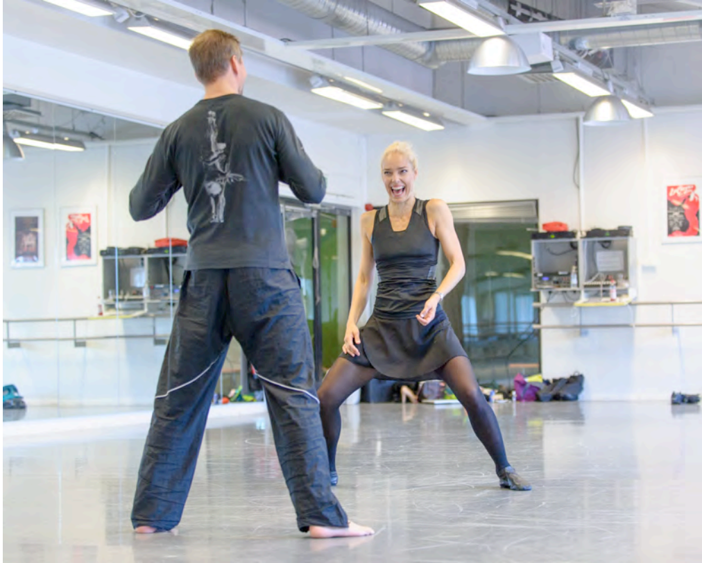
Picture 2. Passion derived from joint, playful moments offstage

We laugh a lot offstage. Our humour derives from the comic nature of everyday situations. Many times I start saying something and then my colleague continues from my thought by finishing it in a funny way. I think the passionate playfulness is related to our embodiment at work, and we need the playfulness to be creative and ready to throw ourselves into the moment. Of course, there are people with verbal skills, but I couldn't be funny verbally. For us humour is attached to our bodies. (Retired ballet dancer, an extract from a photo-elicitation interview, 19 April 2013)