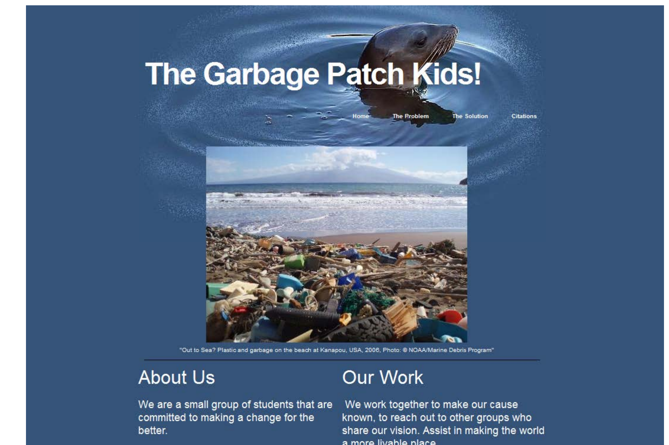
Image: Home page of the Garbage Patch Kids Website