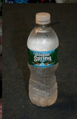
Redesigned Poland Spring bottle