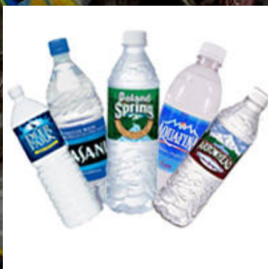
Examples of wasteful water bottles