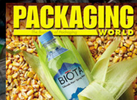
The biodegradable corn based water bottle