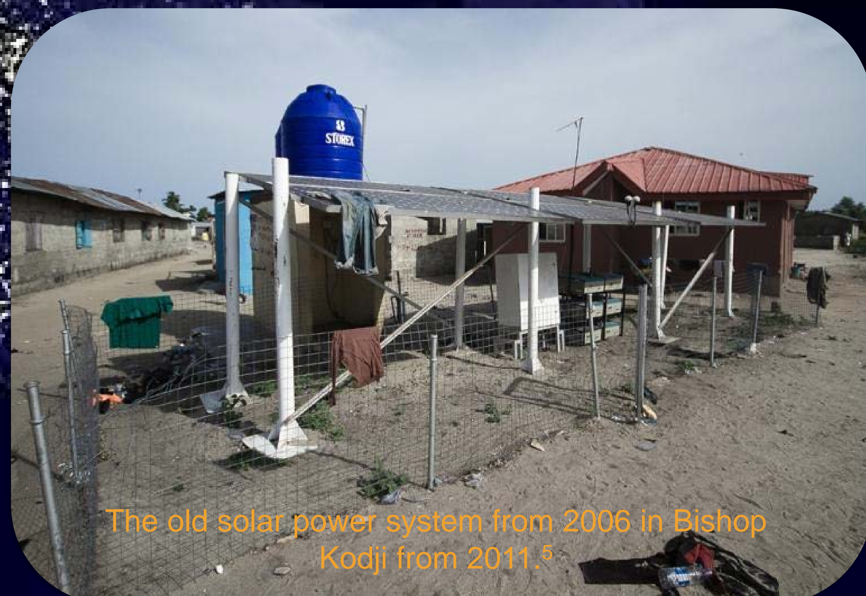
The old solar power system from 2006 in Bishop Kodji from 2011. 5