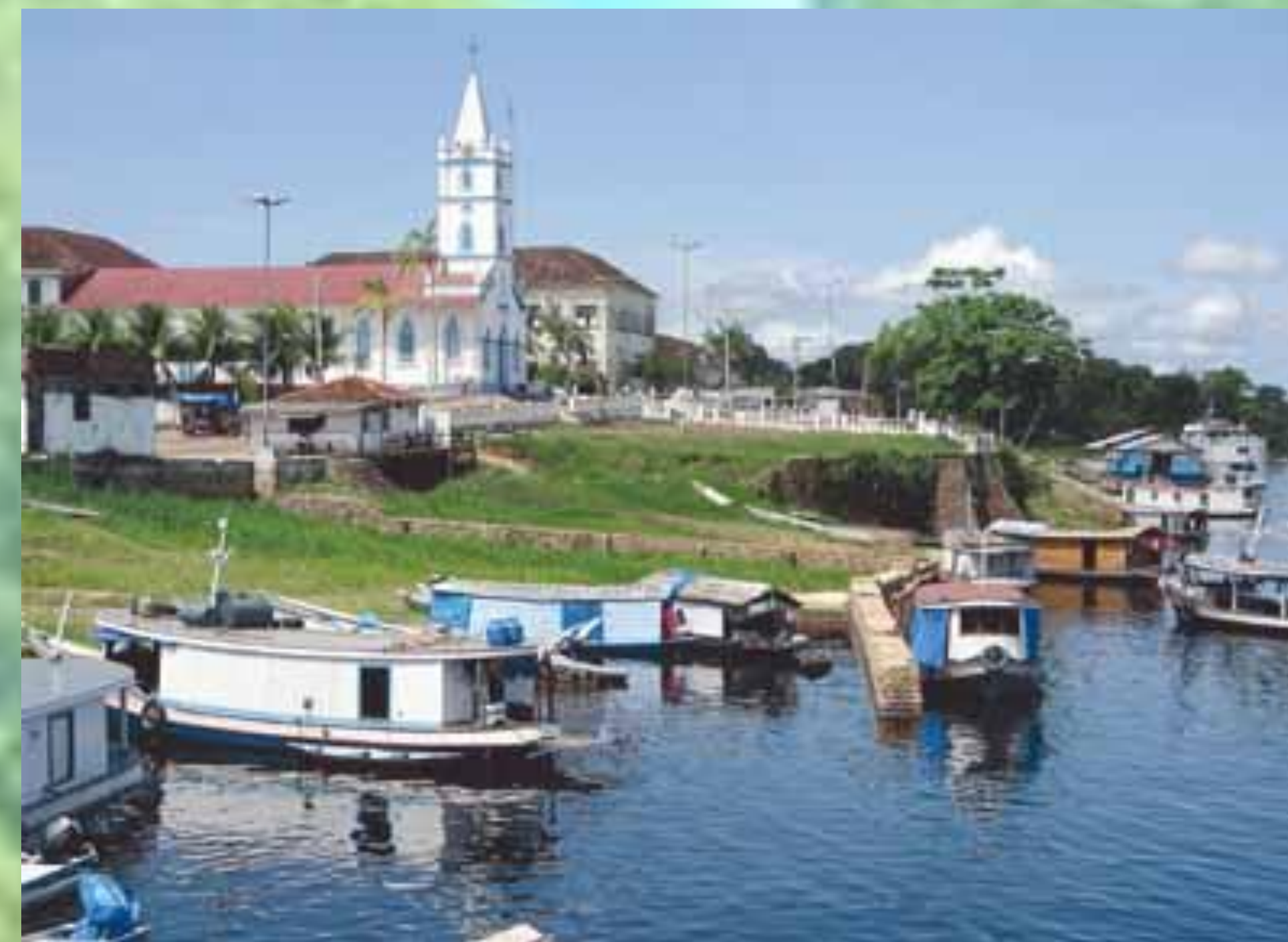
Waterfront of Barcelos, Brazil [1]

The purpose of this research is to examine the potential advantages and issues of implementing a recent development in small hydrokinetic power known as Vortex Induced Vibrations for Aquatic Clean Energy (VIVACE). The objective of this project is to investigate whether VIVACE hydrokinetic energy systems are capable of powering towns, as well as being low impact, cost effective power generators. The analysis in this research includes 1) a review of VIVACE technology, 2) energy estimates for the (test) region of Barcelos, Brazil in the Amazon, 3) calculations per kilowatt hour generated by a VIVACE system for the Barcelos region.