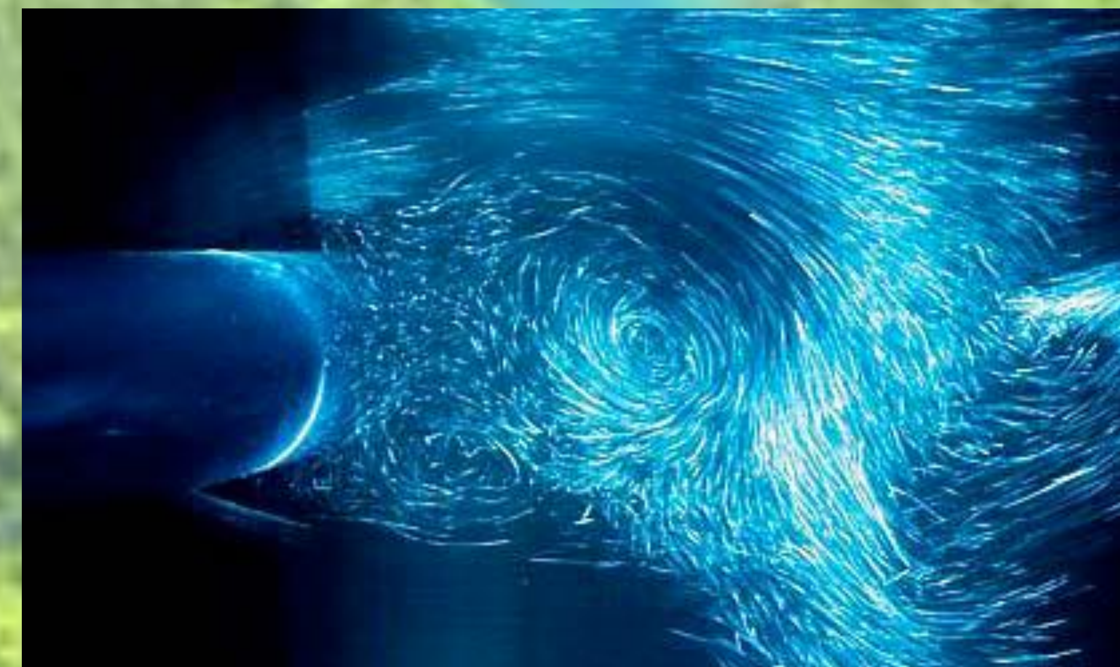
Vortex used to power VIVACE Converters [3]