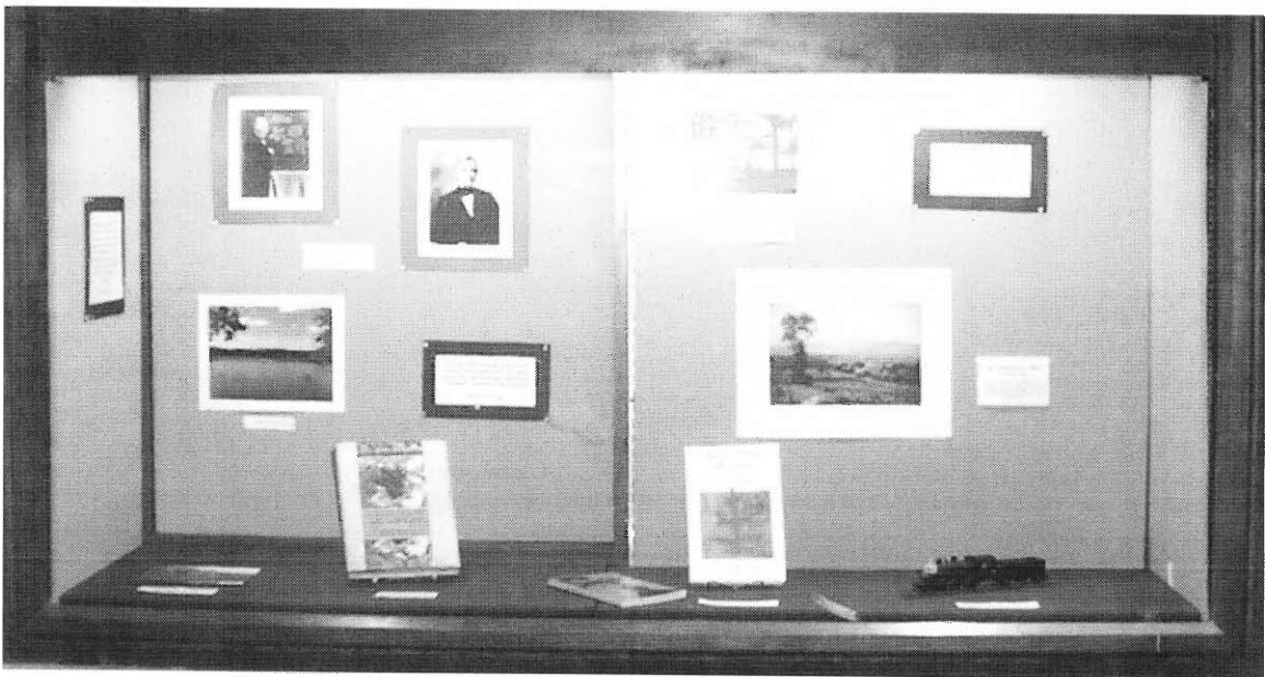
Picture of the display case seen when leaving the library.