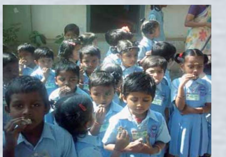
Golly. (2005). It Really Does do you Good: Nutritional Values. Retrieved from http://www.poverty.ch/documents/spirulina.pdf