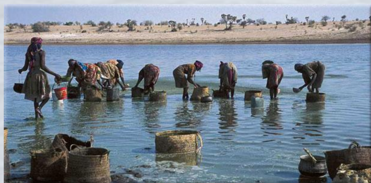
Women collecting spirulina