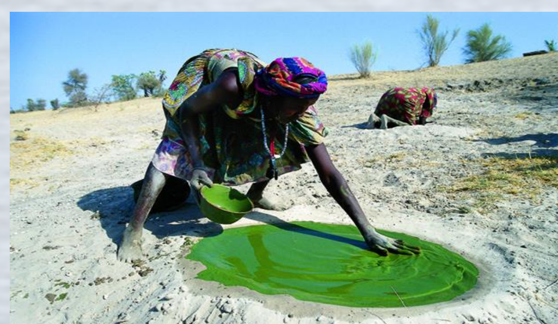
Drying of spirulina in seasonal pools