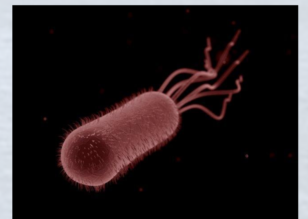
Thinkstock. (10/02/2013). Recruiting E. coli to combat hard-to-treat bacterial infections. Retrieved from http://www.acs.org/content/acs/en/pressroom/presspac/2013/acs-presspac-october-2-2013/recruiting-e-coli-to-combat-hard-to-treat-bacterial-infections.html