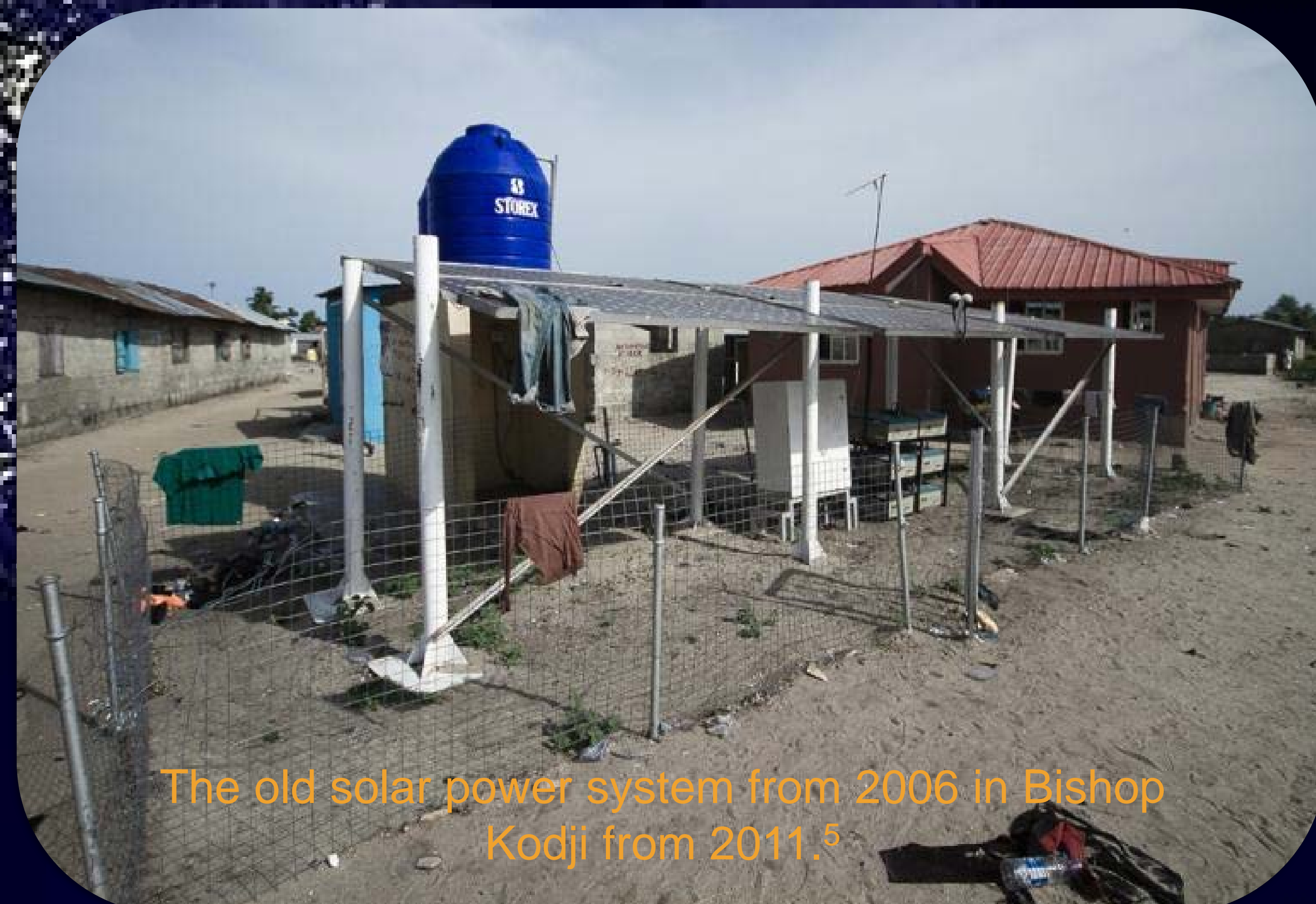
The old solar power system from 2006 in Bishop Kodji from 2011. 5