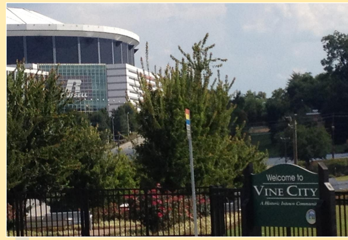
View of stadium from Vine City