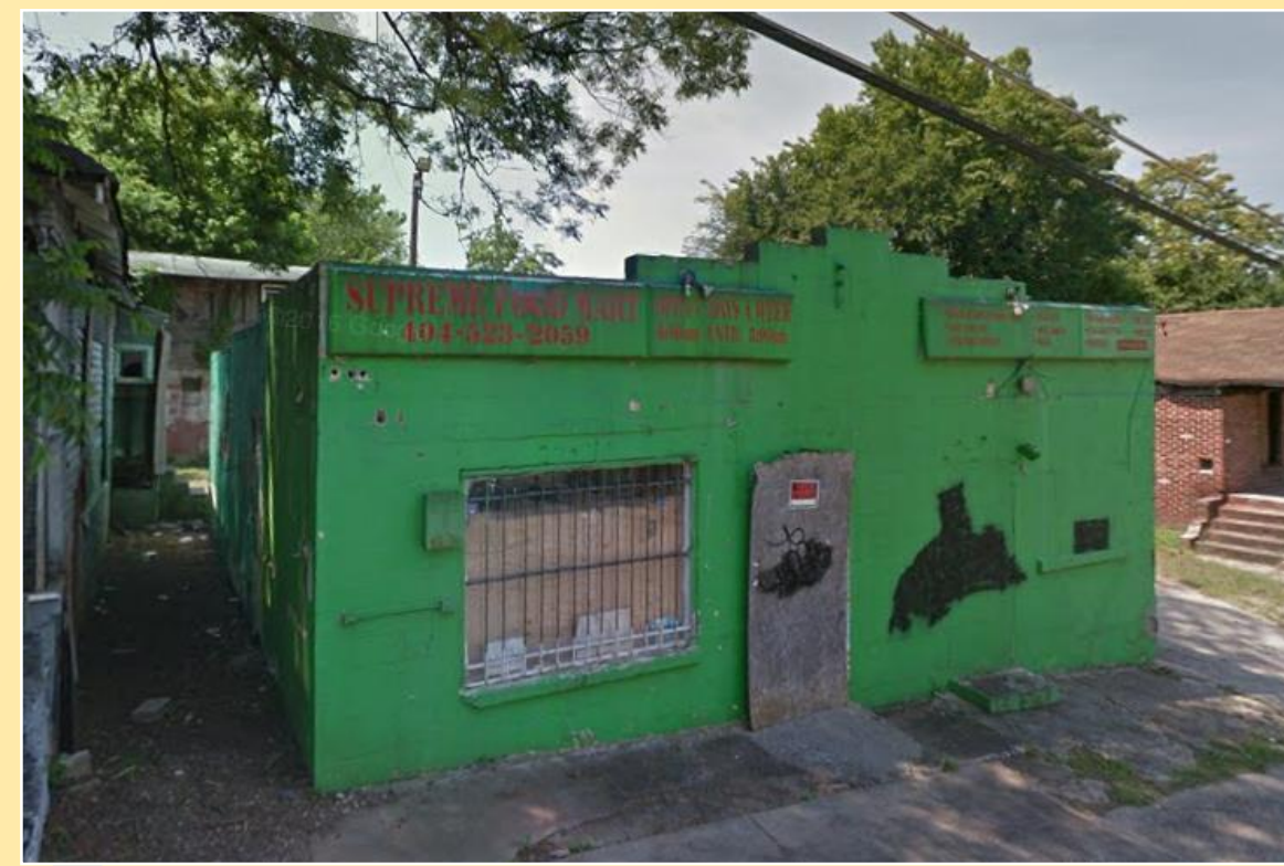
Labelled "Grocery Store" on map