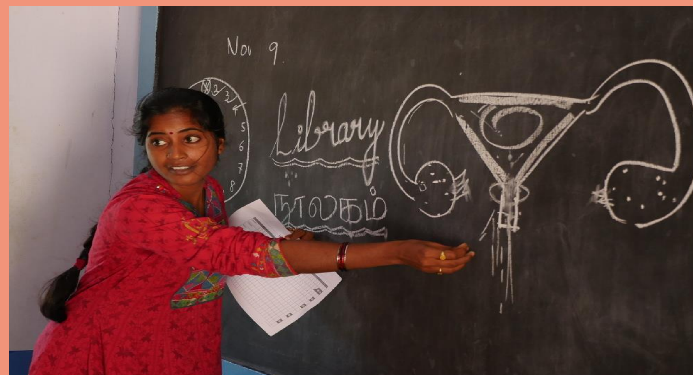
A class organized by EcoFemme