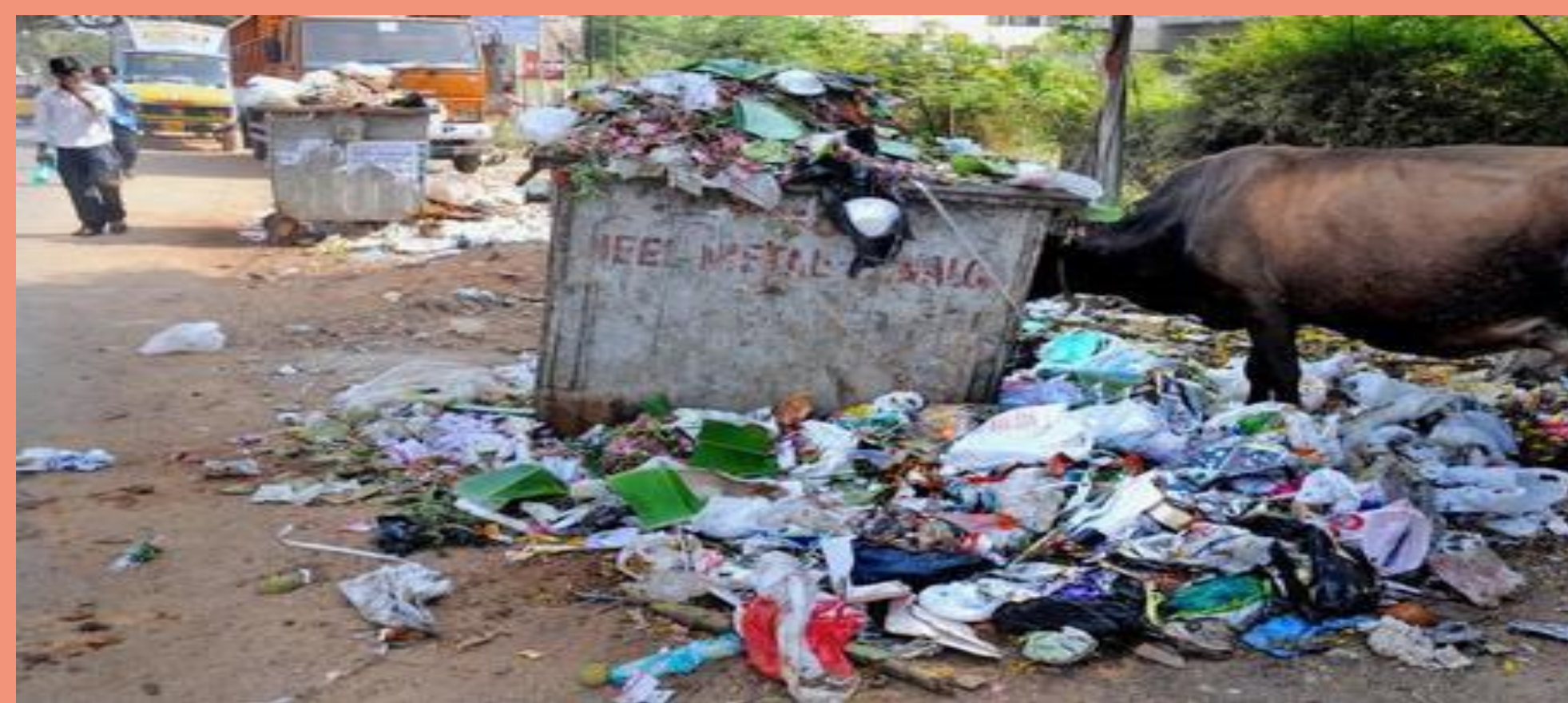
Garbage and pollution in an Indian street. Disposable pads contribute to pollution.

EcoFemme: Classroom education about menstruation, distributes reusable pads Indian government: subsidies for disposable pads