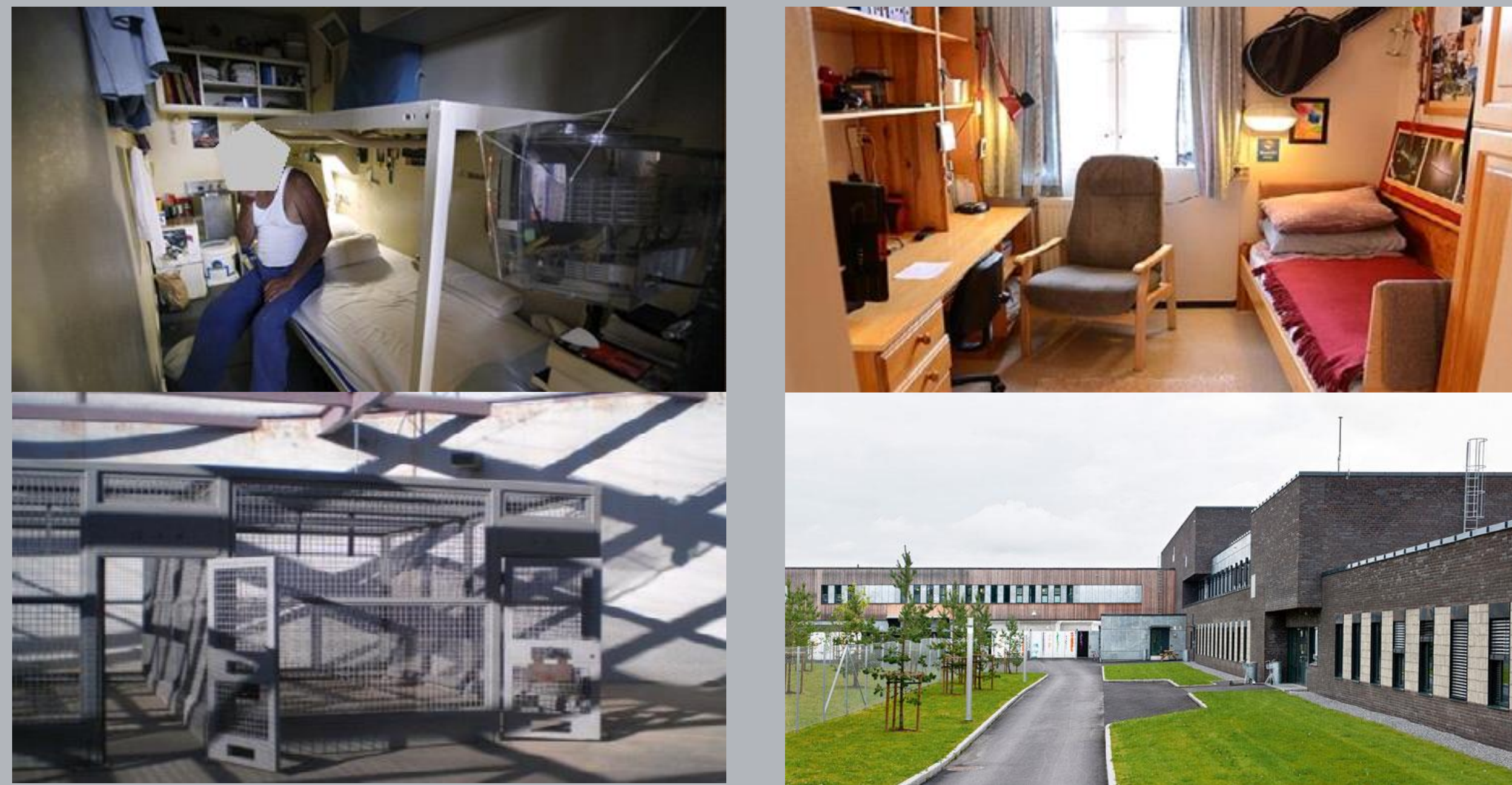
American Prisons vs. European Prisons

Men who suffer from substance abuse in American state prisons often receive a lower level of care than those in most European prisons.