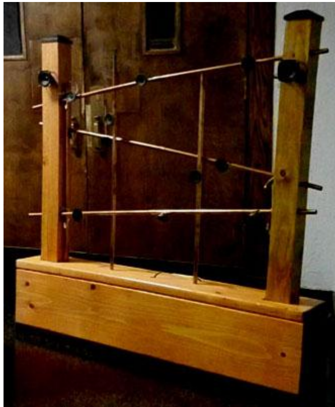
Figure 7: The GameWave speakers (1 of 2 shown).

The final speaker setup is actually a left over design from a previous project completed by a group of WPI students. The piece is made of two frames built from wood and copper tubing, through which ten tweeter and two woofers each are strung. The back is also fitted with a strip light, giving the setup a bluish glow when lit. This minimalistic and artistic design fits in perfectly with the GameWave design, as the slightly angled piping is actually somewhat reminiscent of the original Donkey Kong game, which can help add to the enjoyment for older participants. These speakers were provided by Professor Bianchi and the WPI music department and only minor repairs had to be done (such as reaffixing some speaker heads to the pipes) before it was ready to be plugged in to the final system.