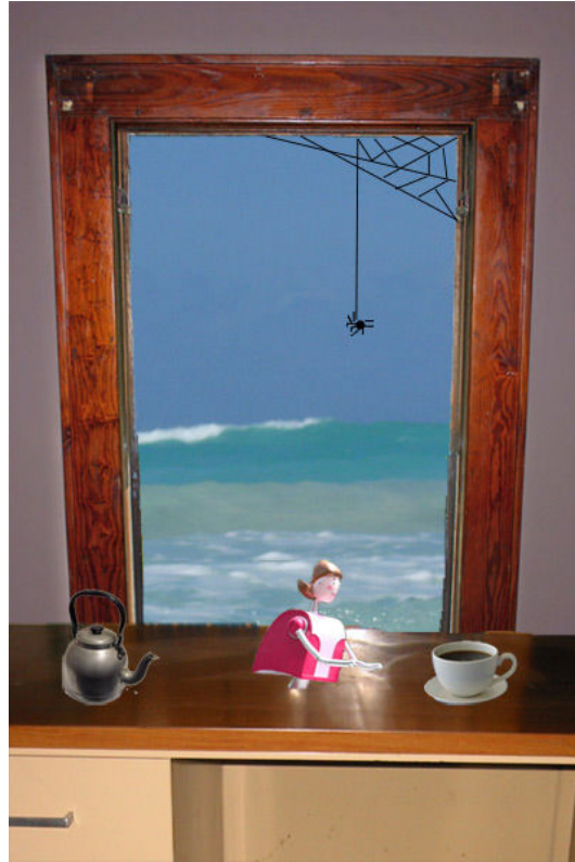
Fig. 3.2 – New desk graphic

The inspiration for the color scheme of the original site is drawn from the forest image used throughout. I have chosen to continue this color selection, focusing on greens and blues to correspond with my own “desk picture”, selected to echo the original site.