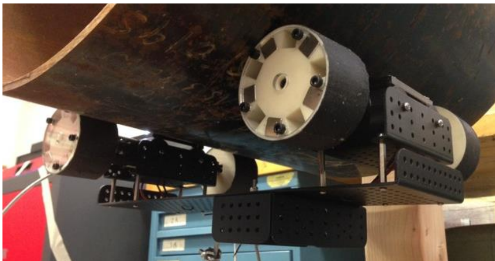
Figure 2: Final Manufactured Mobile Robotic Platform

We believe that the focus of future work should be improved design and reiterations of the testing we performed. Additional testing should investigate the payload effects of adding wheels, reducing magnet size, multiple wheel designs, magnet orientation, and wheel size. With these tests, further design of a more robust chassis will be needed. This chassis should include high torque motors in order to better meet the needs of our applications. The consolidation of electronics down to one microcontroller as well as the integration of more sensors allowing for autonomous pipe traversal with advanced software functionality is also an area of future work. The team feels that the deductions that we have made in terms of design and testing have laid out a solid groundwork for a possible revolution in the oil and gas pipeline welding industry.