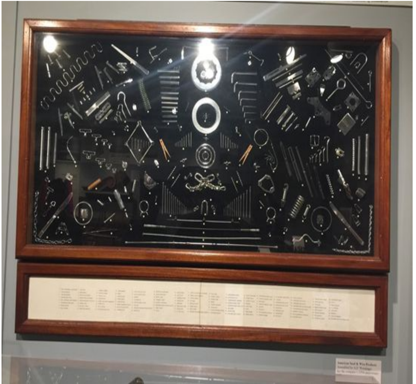
Image 1.1. American Steel and Wire Product Display created by A. F. Weissinger for the company's one hundred twenty-fifth anniversary. This captivating panel in WHM's Fuller Gallery neatly captures some of the diversity of production that characterized just one company in Worcester larger steel and wire sector.