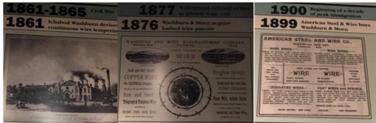
Image 1.4. From the timeline along the ceiling. Milestones in Washburn and Moen's history are noted.

All artifacts, images, and text that adorn the Gallery room are presented by obsolete means. Supported on a ponderous hip rail, flipbooks and corded telephones preface each exhibit, beckoning visitors with a physical approach to learning, appealing mainly to the physical senses